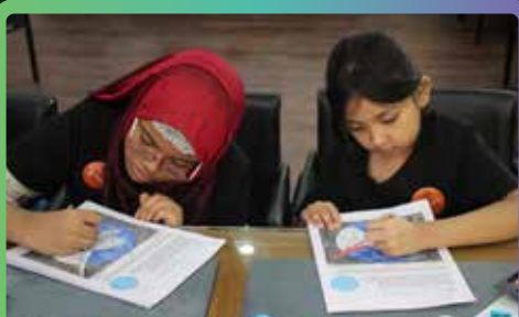
Aviation Challenge Bangladesh