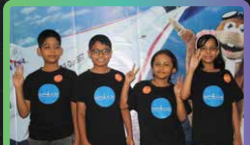
Rocket Making Workshop