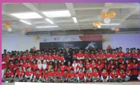
Space Apps Next Gen

Within the short period of establishment, Space Innovation Camp conducted 50+ Successful Camps, Seminars and Workshops. Its noteworthy activities are highlighted below: