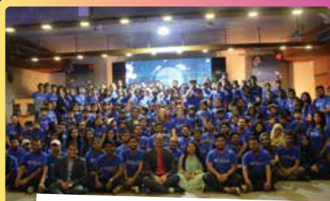
Space Innovation Camp