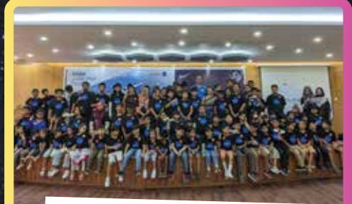
NASA Junior Pilot Program