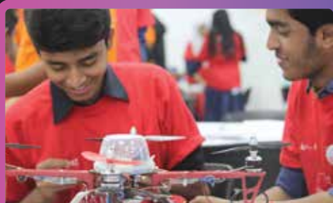
Space Robotics Workshop